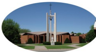
St. Patrick Church San Patricio 4100 Broadway

School: website~sitio: www.gbhollyfamily.eduk12.net Email~Correo Electrónico: office@gbhollyfamily.org Phone~Teléfono: 620.793.3265 Fax 620.792.2798