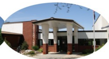
Holy Family School Escuela de la Sagrada Familia 4200 Broadway