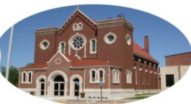
St. Rose of Lima Church Santa Rosa de Lima 1424 Baker