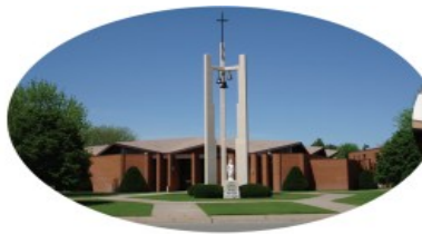
St. Patrick Church San Patricio 4100 Broadway

School: website~sitio: www.gbhollyfamily.eduk12.net Email~Correo Electronico: office@gbhollyfamily.org Phone~Teléfono: 620.793.3265 Fax 620.792.2798