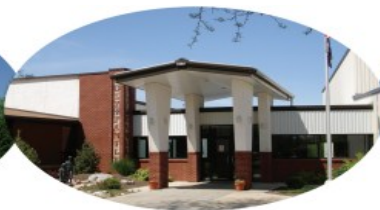
Holy Family School Escuela de la Sagrada Familia 4200 Broadway