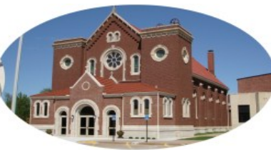
St. Rose of Lima Church Santa Rosa de Lima 1424 Baker