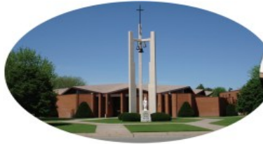
St. Patrick Church San Patricio 4100 Broadway

School: website~sitio: www.gbhollyfamily.eduk12.net Email~Correo Electronico: office@gbhollyfamily.org Phone~Teléfono: 620.793.3265 Fax 620.792.2798