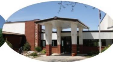
Holy Family School Escuela de la Sagrada Familia 4200 Broadway