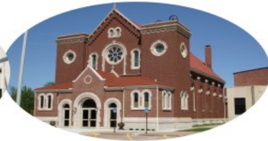
St. Rose of Lima Church Santa Rosa de Lima 1424 Baker