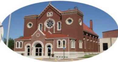
St. Rose of Lima Church Santa Rosa de Lima 1424 Baker